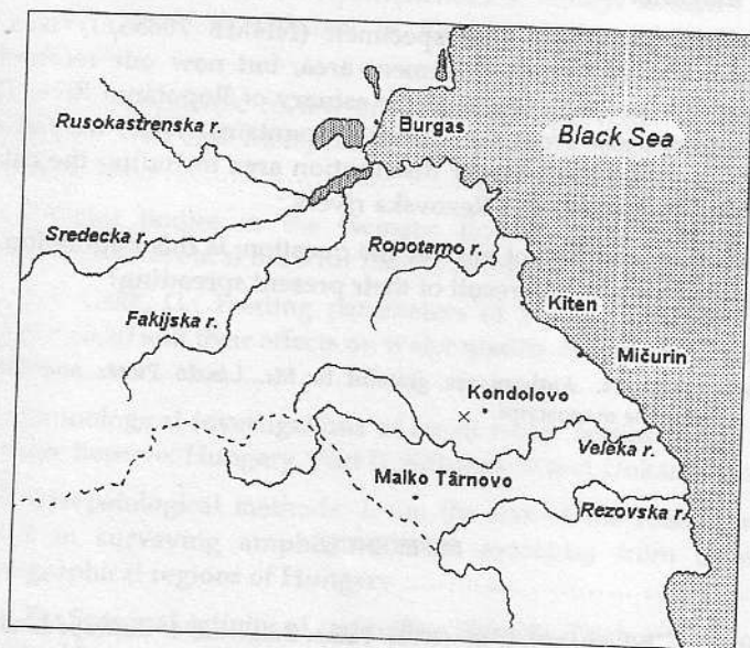
Fig. 2. Bulgarian occurrence of Dobatia goettingi Brandt (indicated by crosses)